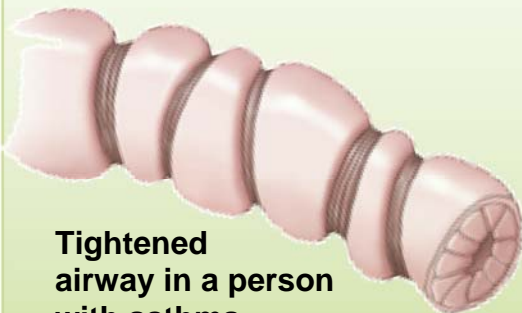
Tightened airway in a person with asthma